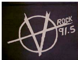
The original V-ROCK logo was an upside down anarchy sign. The station was often referred to as "Upside-down anarchy rock."