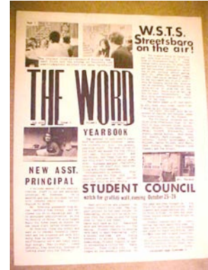
In 1971 the school newspaper "The Word" mistakenly referred to the new radio station as WSTS